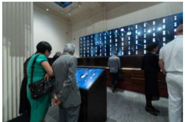
Pou Maumahara interior

In Pou Maumahara these screens offer a welcoming portal into the medal collection. The user interface is visual and intuitive, it provides a window which engages our audience in the stories our collection.