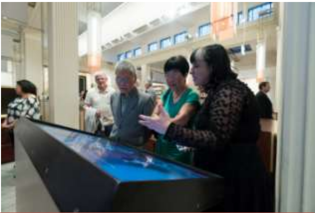
Pou Maumahara interior

Auckland Museum makes extensive use of Vernon CMS, particularly for the management of the collections and military service records. The Museum uses the Activities module's project management features to track processes such as conservation work, acquisition and loans.